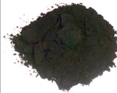
B2801 Proximate coal reference material