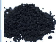
EMASorb B granular B1164