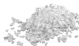
EMADrone magnesium perchlorate B1161