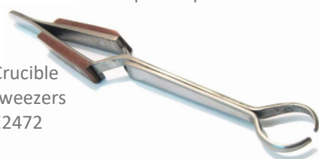
Crucible tweezers E2472