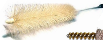
Cleaning brush E2423