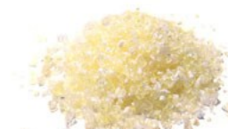
Schutze reagent B1519

These products offer the same high quality and value for money that is typical of Elemental Microanalysis' entire product range.