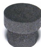
Graphite tip E2421