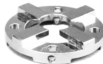
Graphite tip holder E2420