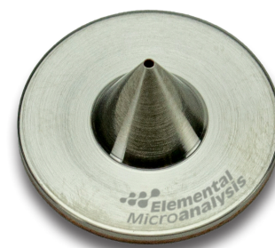
Skimmer Cone (V4005)