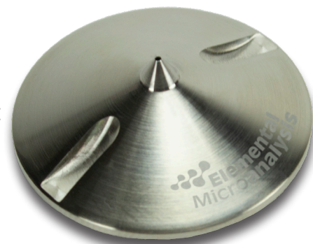
Micro-Skimmer Cone (V4001)

Our 45 years of expertise in offering high quality OEM alternative consumables to our customers is now extended to cover your ICP-MS needs! Elemental Microanalysis is now extended to cover your ICP-MS needs (cones and skimmers) that seamlessly support the needs of our customers who have trace elemental analysis capability laboratories.