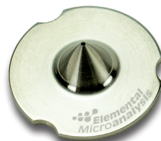
'H' Skimmer Cone (V4008)

Our confidence in our products allows us to offer you a total satisfaction guarantee: if our product does not perform at least as well as the brand of product you usually use, you can return it for a full refund.