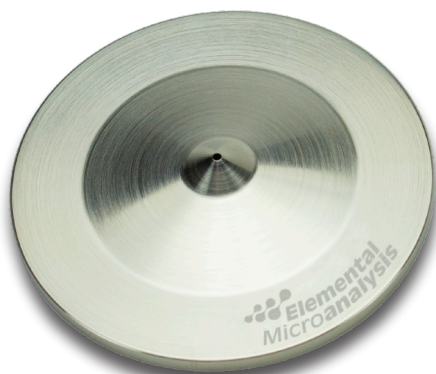
Sample Cone (V4007)